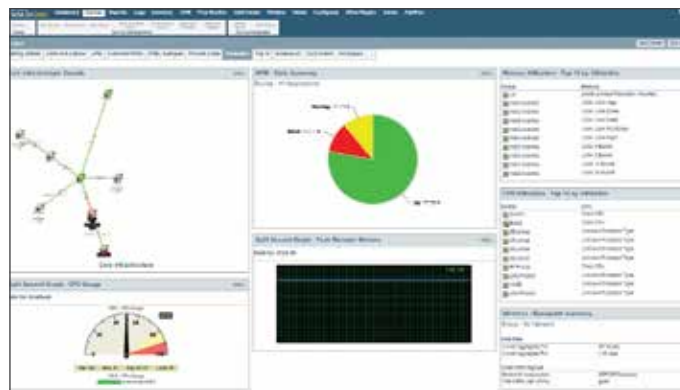
WhatsUp Gold provides a unified view so you can see everything on your network.

WhatsUp Gold also features integrated inventory reporting including hardware inventory, reports on installed software and updates, warranty reports, and more. These reports save both time and money and can decrease year-end IT inventory activities from weeks to minutes. The reports will also help you find under-utilized hardware resources that can be re-deployed and identify unlicensed software to avoid expensive true-up costs.